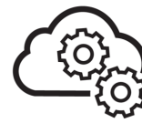
Cloud processing & storage